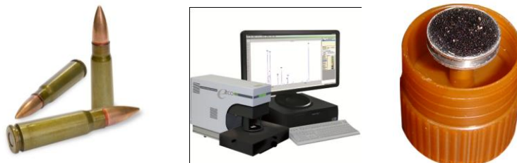
Bullets, the Foster + Freeman ECCO, and a GSR 'stub'

Gun shot residue consisting of particles containing the elements Barium (Ba), Lead (Pb) and Antimony (Sb) are frequently found on the arms and clothing of a shooter after firearm discharge.